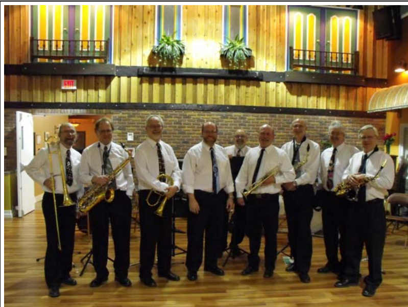
Live entertainment by the Stettler Jazz Guys in the Bay area floating on pontoon boats.